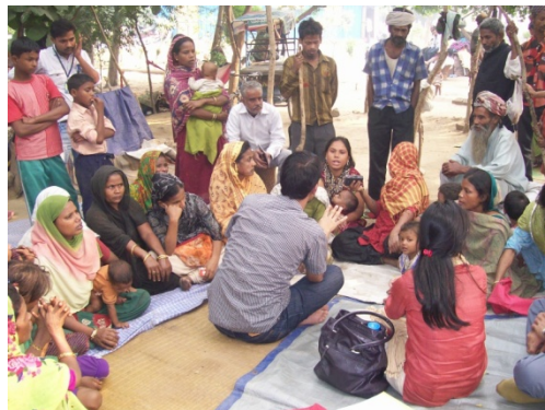
FGD with homeless women