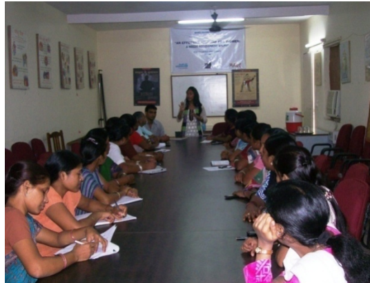
Domestic workers attending the FGD on safety issues of women at Public Places