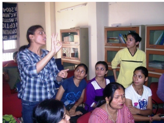
FGD with women with hearing disability